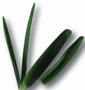
Sapphire (left) has a finer leaf in comparison to other Buffalo varieties (right)

Sapphire has the vigour of a young vibrant breed and establishes extremely well. Sapphire soft leaf Buffalo was bred in Australia from the older Australian variety of Sir Walter Buffalo turf. Next generation Sapphire looks so much better and finer textured than other varieties. Sapphire is easily as good as any other Buffalo in performance. Sapphire - performance and good looks.